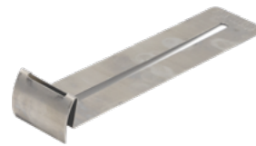
A-PED-WALL Edge Restraint