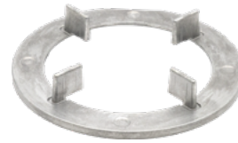
A-PED-TABS-RING-3MM Thickness: 3mm Height: 11mm